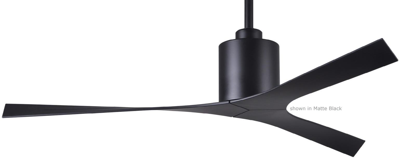
shown in Matte Black