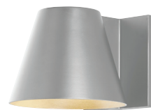
BOWMAN 4 shown in silver