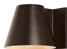
BOWMAN 4 shown in bronze