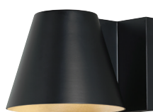
BOWMAN 4 shown in black