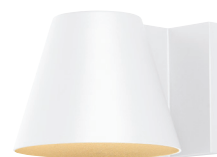
BOWMAN 4 shown in white