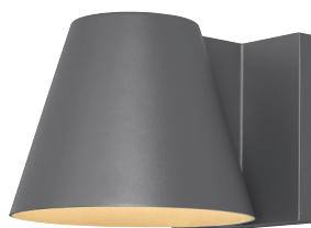
BOWMAN 6 shown in charcoal