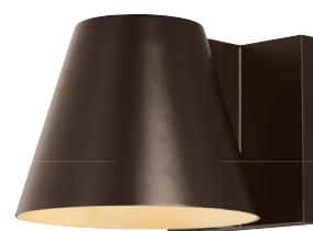
BOWMAN 6 shown in bronze