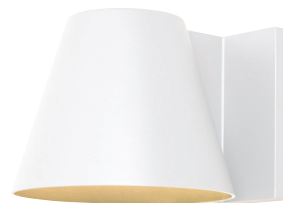
BOWMAN 6 shown in white