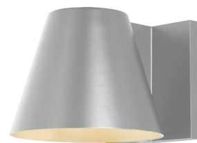
BOWMAN 6 shown in silver