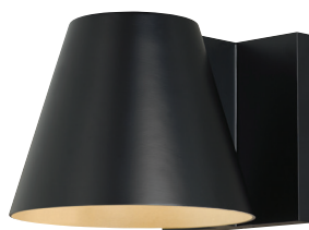
BOWMAN 6 shown in black

** Available in Black and Bronze finish only.